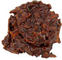
CH-42pc: Dark-Orange Rocher Feuillantine Crispy Feuillantine flakes in a dark-orange couverture (Non-alcoholic). Approximately 8 g. Size: 4 cm Ø x 2.5 cm. Shelf life 3 months. MOQ: 62 pieces Baht 7.2 per piece