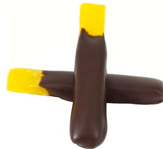
CH-10pc: Mango Stick Candied mango stick covered with dark chocolate couverture (Non-alcoholic) Approximately 4 g. Shelf life 3 months. MOQ: 125 pieces Baht 3.6 per piece