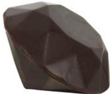
CH-65pc: Diamond A creamy passion fruit ganache in a dark chocolate covering (Non-alcoholic). Approximately 14 g. Size: 3.5 cm Ø x 3 cm. Shelf life 45 days. MOQ: 35 pieces Baht 12.7 per piece