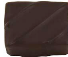
CH-35pc: Mango Chocolate Jelly An Indian mango jelly in a dark chocolate covering (Non-alcoholic). Approximately 12.5 g. Shelf life 45 days. MOQ: 40 pieces Baht 11.3 per piece