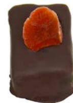
CH-37pc: Strawberry Chocolate Jelly A strawberry jelly in a dark chocolate covering topped with a sliced candied strawberry (Non-alcoholic). Approximately 16 g. Shelf life 45 days. MOQ: 30 pieces Baht 14.5 per piece