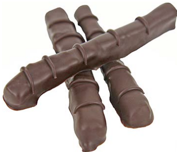
CH-15apc: Orange Stick Imported candied orange stick covered with dark chocolate (Non-alcoholic) Approximately 6 g. Shelf life 3 months; MOQ: 125 pieces Baht 7.8 per piece