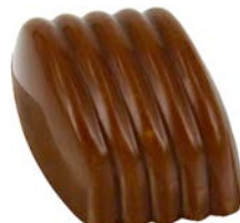
CH-33pc: Cappuccino Praline A creamy cappuccino praline flavored with Kahlua in a milk chocolate covering Approximately 12.5 g. Size: 3 x 2.7 x 1.9 cm. Shelf life 45 days. MOQ: 40 pieces Baht 11.25 per piece