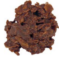
CH-44pc: Milk-Orange Rocher Feuillantine A crispy Feuillantine flakes in a milk-orange couverture (Non-alcoholic). Approximately 8 g. Size: 4 cm Ø x 2.5 cm. Shelf life 3 months. MOQ: 60 pieces Baht 7.2 per piece