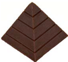
CH-29pc: Passion Fruit & Strawberry Pyramid A passion fruit chocolate ganache flavored with passion fruit cream with a dehydrated strawberry in a dark chocolate covering Approximately 12 g. Size: 3.1 x 3.1 x 2.9 cm. Shelf life 45 days. MOQ: 40 pieces Baht 11 per piece