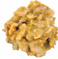
CH-45pc: White Rocher Feuillantine A crispy Feuillantine flakes in a white couverture (Non-alcoholic). Approximately 8 g. Size: 4 cm Ø x 2.5 cm. Shelf life 3 months. MOQ: 60 pieces Baht 7.2 per piece