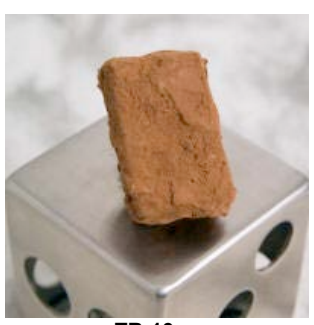
TR-13pc Whisky Truffle

A dark chocolate ganache, flavored with whisky, cut in a rectangle shape and covered with cocoa powder.