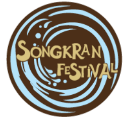
SONG-20 Round dark chocolate with 2 colors Songkran festival graphic Size: 3 cm diameter Box of 50 pieces; S.L: 9 months