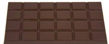
SONGRAYONGBAR-6 Rayong dark chocolate bar 67% with roasted pistachio nuts Minimum Order: 12 pieces Shelf Life: 6 months