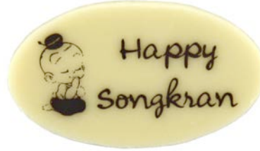
SONG-19 Oval white chocolate with brown happy Songkran graphic Size: 3.5 x 2 cm Box of 50 pieces; S.L: 9 months