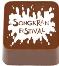
SONG-24 Milk chocolate with pineapple ganache & Songkran graphic Size: 2.8 x 2.8 x 1.4 cm; 12 grams S.L: 45 days; M.O: 50 Pieces