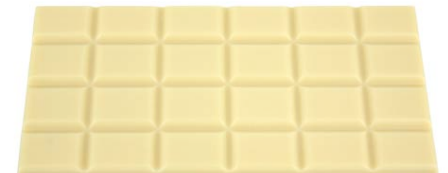
SONGBAR-6 White Chocolate Bar 30% With Roasted Pistachio Nuts 17.5 cm x 11.5 cm; Weight: 100 g Shelf Life: 6 months