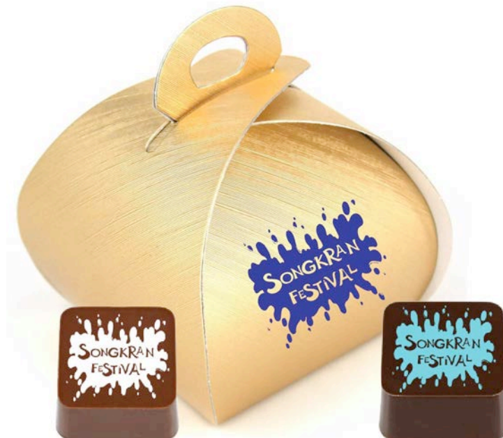
SONG-26 Medium Gold purse with Songkran festival sticker and your choice of 2 Songkran pralines Please mention which pralines you need SONG-23, SONG-24 and SONG-25