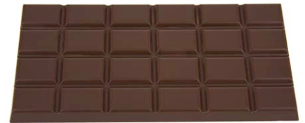
SONGRAYONGBAR -3 Rayong dark chocolate bar 67% Minimum Order: 12 pieces Shelf Life: 12 months