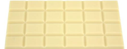
SONGBAR-3 White Chocolate Bar 30% 17.5 cm x 11.5 cm; Weight: 100 g Shelf Life: 12 months