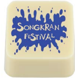
SONG-25 White chocolate with crunchy pistachio praline & Songkran graphic Size: 2.8 x 2.8 x 1.4 cm; 12 grams S.L: 3 months; M.O: 50 Pieces