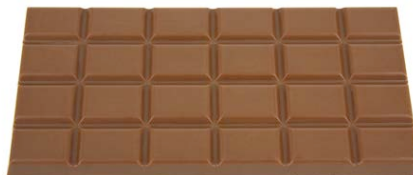
SONGRAYONGBAR-5 Rayong milk chocolate bar 49% with roasted hazelnuts Minimum Order: 12 pieces Shelf Life: 6 months