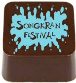
SONG-23 Dark chocolate with crunchy praline filling & Songkran graphic Size: 2.8 x 2.8 x 1.4 cm; 12 grams S.L: 3 months; M.O: 50 Pieces