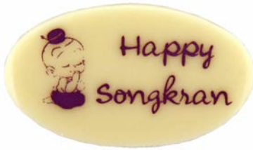
SONG-18 Oval white chocolate with purple happy Songkran Graphic Size: 3.5 x 2 cm Box of 50 pieces; S.L: 9 months