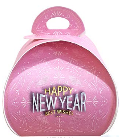
NEWY-11 Happy New Year purse with 2 chocolate bonbons PLEASE KINDLY MENTION YOUR CHOICE OF 2 BONBONS FROM BONBON-1 TO BONBON-9 Shelf life: 45 days