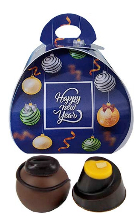
NEWY-6 Happy New Year Purse with 1 Ristretto Truffle and 1 Creamy Mango Praline Shelf life: 45 days