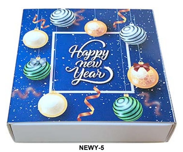
Happy New Year Box with 4 Chocolate Bonbons PLEASE KINDLY MENTION YOUR CHOICE OF 4 BONBONS FROM BONBON-1 TO BONBON-9 Shelf life: 45 days